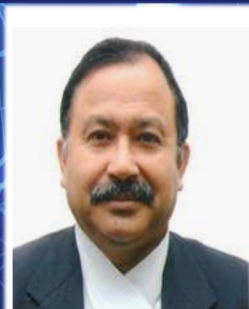
Hon'ble Mr. Justice Kalyan Shrestha Former Chief Justice of the Supreme Court of Nepal.